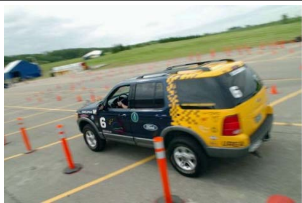
WVU Future Truck 2004

Future Truck. Future Truck is a student design competition, in which 15 universities from across North America compete. Ford and the Department of Energy are the major sponsors. The goal of the competition is to design and build a hybrid vehicle based on the 2002 Ford Explorer platform. In doing this, the teams are expected to improve fuel economy by 25% and reduce harmful emissions while maintaining the performance of the stock vehicle.