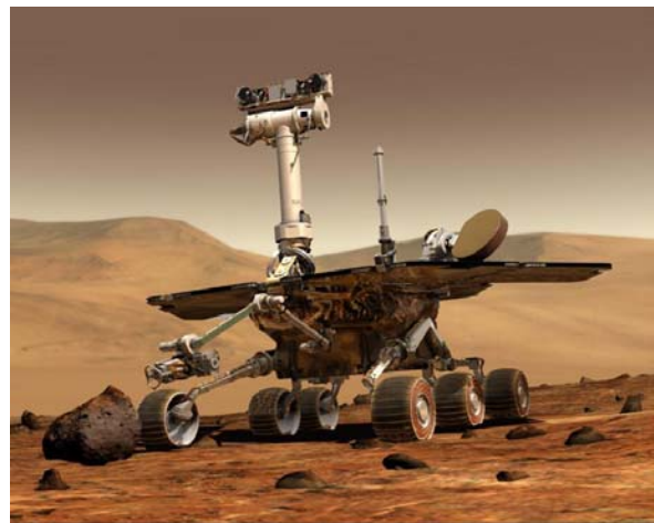
Mars Exploration Rover

We never seem to catch up with all of our alumni. Our database is incomplete and the contact information changes often. We need your help to update our records. Simply visit us on the web at www.mae.cemr.wvu.edu and fill in the web form www.cemr.wvu.edu/alumni/address-update.php